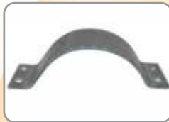
Saddle - Sheared, punched & bump-bent