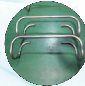
Two wheeler body guard