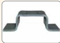
Flat Stock - Sheared & bent