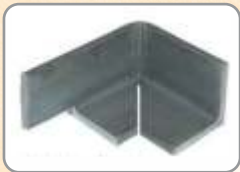
Angle Iron - Sheared, coped, notched & bent

Piranha's logo is known throughout the metal fabricating industry as the symbol of durable, quality-built ironworkers. Piranha equipment is simple in design, heavy in construction, and outfitted with efficient, safe operator features. Piranha ironworker tooling is to make your ironworker even more productive and flexible than you could ever imagine.