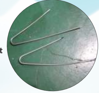
Two wheeler accessory part