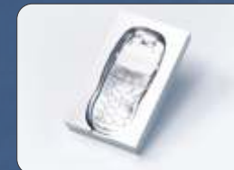
Cell Phone Mould